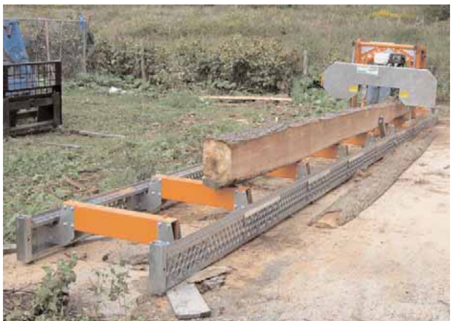
Log bed extensions provide the capability of sawing long timbers.

Russ leaves his mill out in the open and keeps it looking new by employing a cover to protect the saw carriage from the elements. But