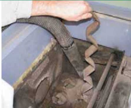
The baffle helps transfer heat from the exhaust tubes to the boiler. Travis cleans ash from the baffles and fire tubes every two or three firings.

ature of the storage tank, water flow through each loop of pipe for the floor heating system, and the flu temperature.