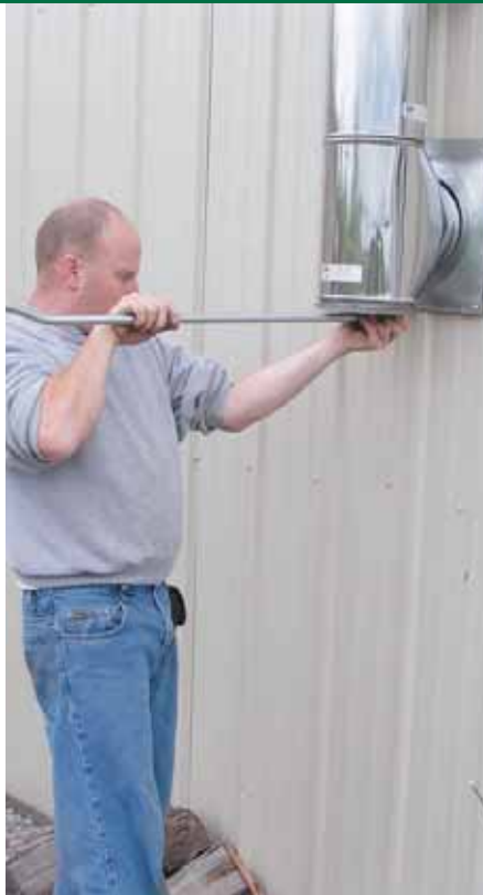
The chimney is double-wall stainless steel. After two and a half years, there has been no noticeable build-up of creosote.

Travis also made a rough estimate of the efficiency of the furnace. “They tout this as 80% efficient. I weighed the wood I put in for a couple of firings and measured the change of temperature of the water storage tank. I came up with an efficiency in the mid-60 percentile over an entire burn cycle, which isn’t that