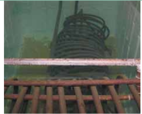
Inside the heat storage tank, showing the heat exchange coils to the boiler (rear) and the domestic water heater (front).

While we waited for the fire to heat up the chamber, Travis lifted the Styrofoam cover off the top of the 1,250-gallon storage tank, reveal-