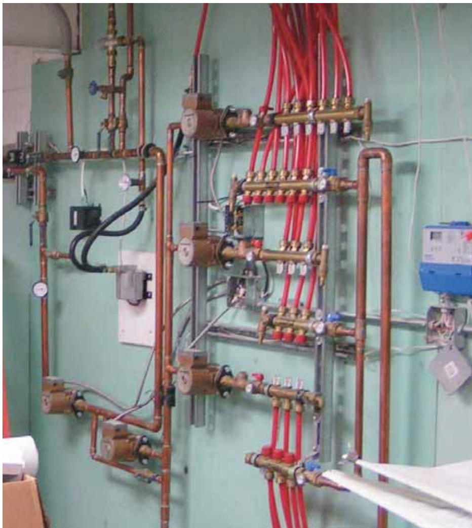
Travis Creswell's storage and distribution system. Note the number of gauges, pumps, and valves. Travis is meticulous in monitoring his furnace.

Running relatively cold water from the storage tank heat exchanger into the steel boiler can cause